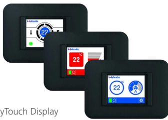
BlueCool MyTouch Display