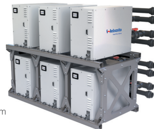
BlueCool V-PRO system